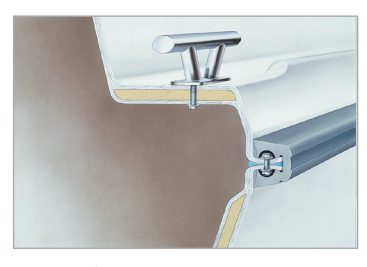
1985 Innovation of the energy-efficient sandwich hull and Divinycell application.

At The Nimbus Group the environment has always been an important factor. We are proud to possess documented environmental policies stretching back over several decades. Here are some examples: