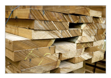
> 1999 Introduction of climatesmart materials such as ecologically grown teak and ongoing projects to inspect the ecological validity of all materials used in our boats.