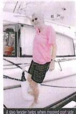
A step fender helps when moored port side