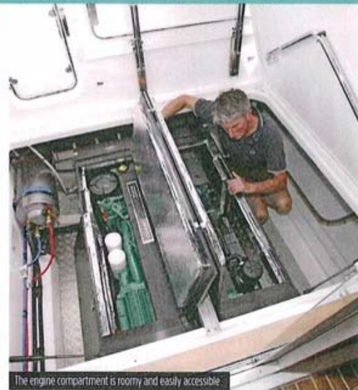
The engine compartment is roomy and easily accessible

"All-in-all we couldn't have designed a better boat for our needs"