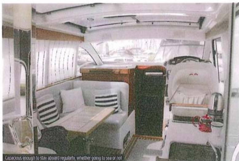
Capacious enough to stay aboard regularly, whether going to sea or not

elements as you like. All-in-all we couldn't have designed a better boat for our needs.