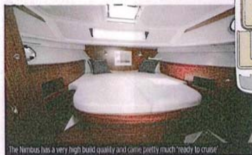
The Nimbus has a very high build quality and come pretty much 'ready to cruise'

To a certain extent this full inventory is reflected in the price, but given that it includes the must-haves – such as heating and not just a bow thruster but one at the stern too – plus