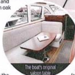
The boat's original saloon table

There have been only minor problems with the boat, which have been quickly resolved by Offshore and Ropewalk, who are the Volvo agent at the Yacht