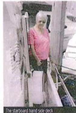
The starboard hand side deck