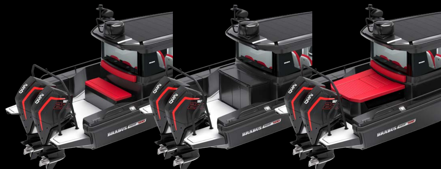
Aft Bench (Standard)

BRABUS Shadow 500 Cabin Black Ops Limited Edition '1 of 28' Dual Mercury Marine V8 Pro XS 250hp 225,500 €