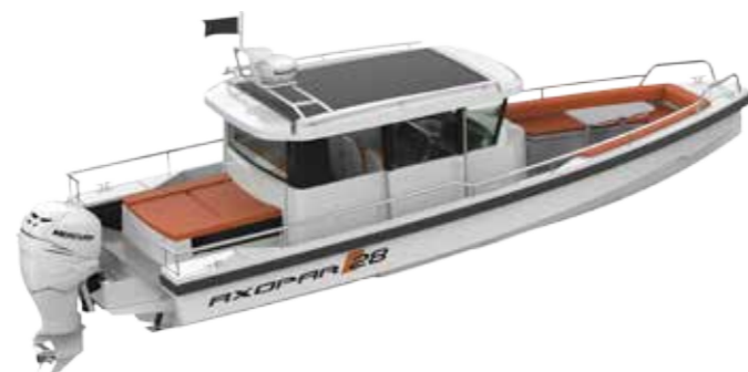
aft cabin (optional)