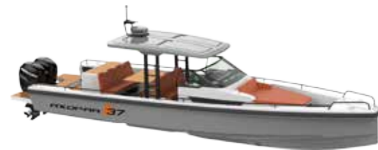
AXOPAR 37 T-TOP VERSION R