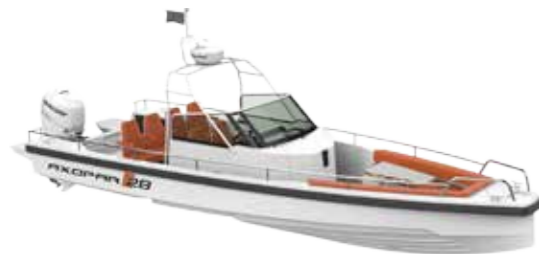
AXOPAR 28 OPEN