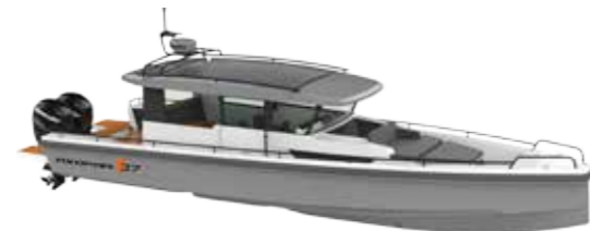
AXOPAR 37 VERSION R