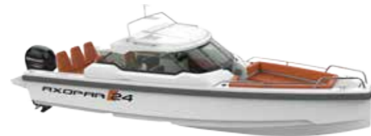
AXOPAR 24 HT