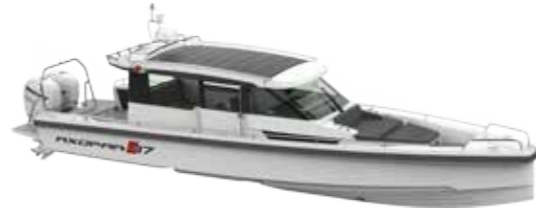
AXOPAR 37 SPORTS CABIN