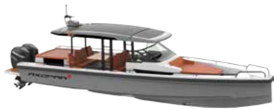
AXOPAR 37 SUN-TOP VERSION R