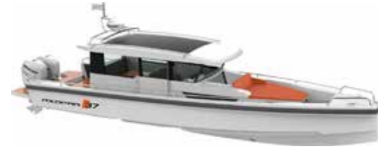
AXOPAR 37 CABIN