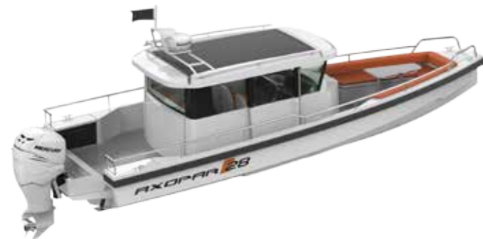
open aft deck (standard)