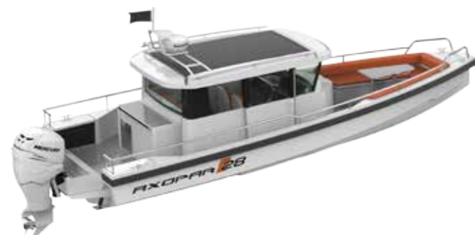
wet bar (optional)