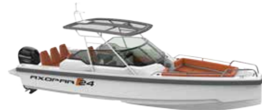
AXOPAR 24 T-TOP