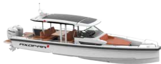
AXOPAR 37 SUN-TOP