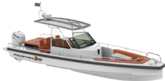
AXOPAR 28 T-TOP