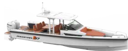
AXOPAR 37 T-TOP